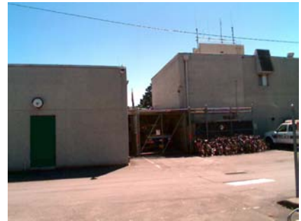
N Vertical Irregularity Primary