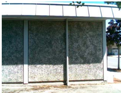
W Primary Structural Type