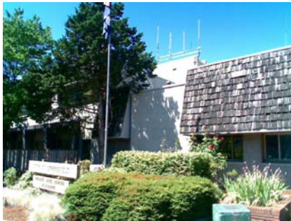
SE Vertical Irregularity Primary