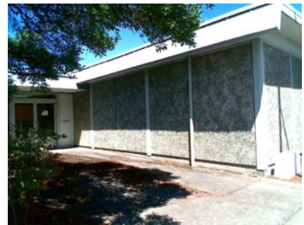
SW Plan Irregularity Primary