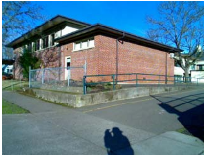
SW Vertical Irregularity Primary