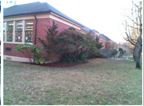
NE Vertical Irregularity Secondary