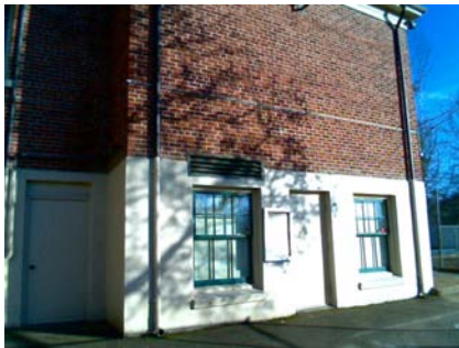
W Primary Structural Type