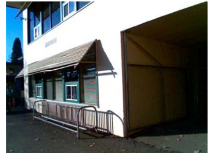
S Primary Structural Type