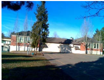
S Elevation View wood infill area between brick wings