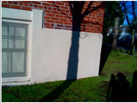
S Primary Structural Type