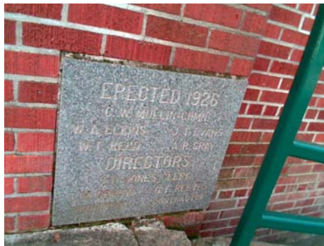
N Field Verified Year Built