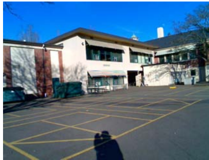
SW Plan Irregularity Primary