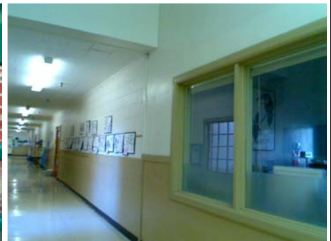
S Primary Structural Type