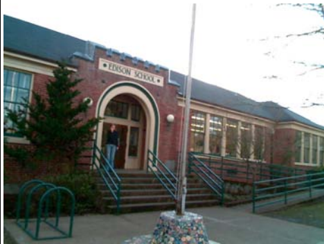
N Falling Hazard