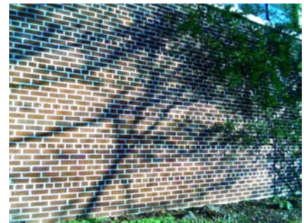
W Secondary Structural Type