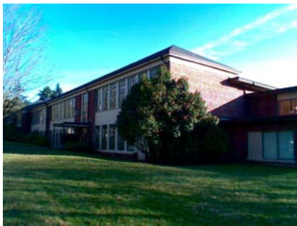
NW Plan Irregularity Primary