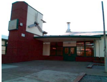
N Falling Hazard