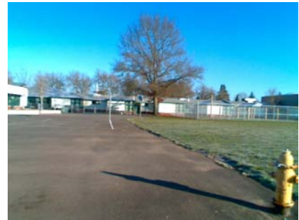
S Plan Irregularity Primary