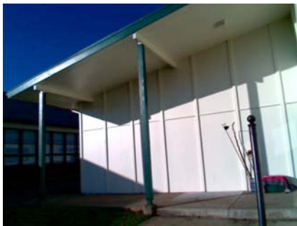
E Primary Structural Type