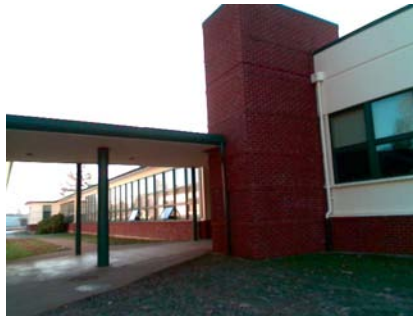
N Elevation View b on left