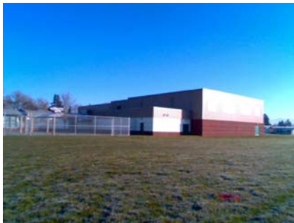
SW Vertical Irregularity Secondary 1995 gym on rt