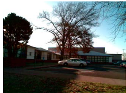
NW Vertical Irregularity Primary