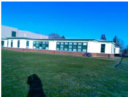
SE Plan Irregularity Primary