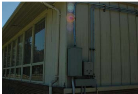
W Primary Structural Type