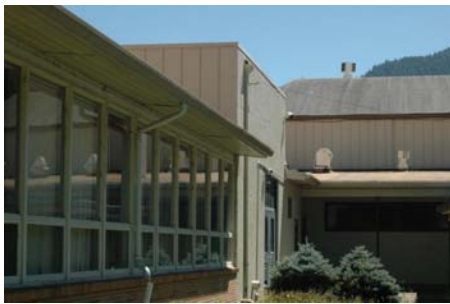
W Vertical Irregularity Primary reentrant corner