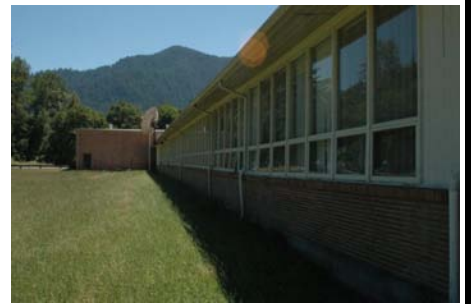
N General Site