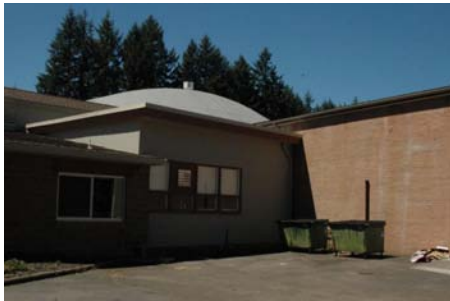
SE Plan Irregularity Primary