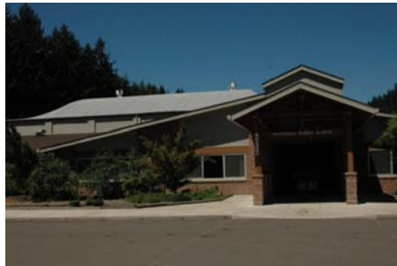
SE General Site