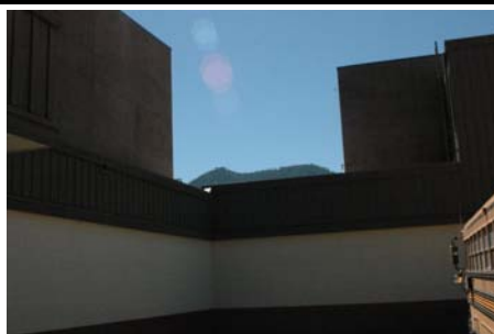
NE Vertical Irregularity Primary and reentrant corner