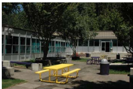
S General Site