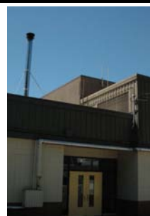
NE Vertical Irregularity Primary