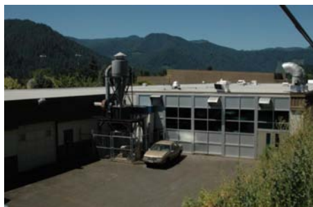
NE Plan Irregularity Primary