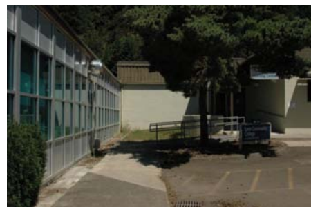
SE Plan Irregularity Primary