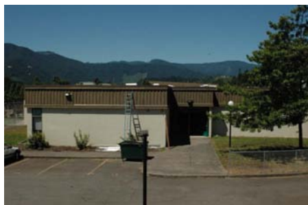
E General Site