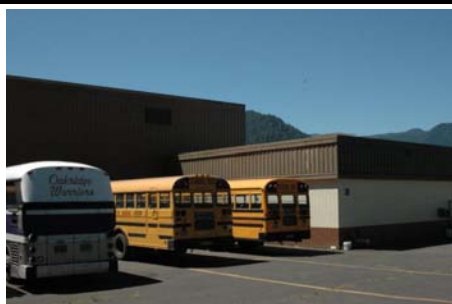
NE Vertical Irregularity Primary and reentrant corner