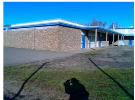
SE Falling Hazard