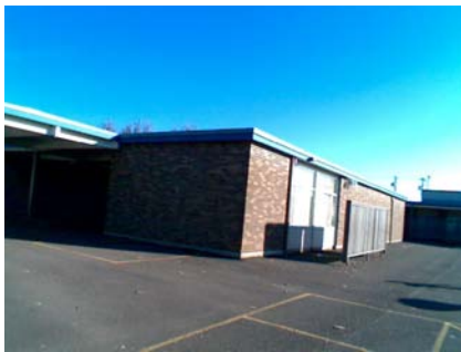
SW Elevation View