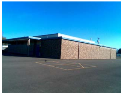
SW Elevation View mech screen on roof