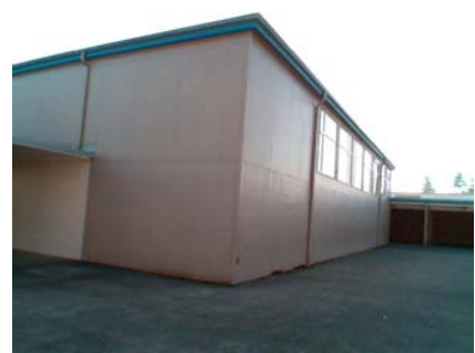
NW Elevation View