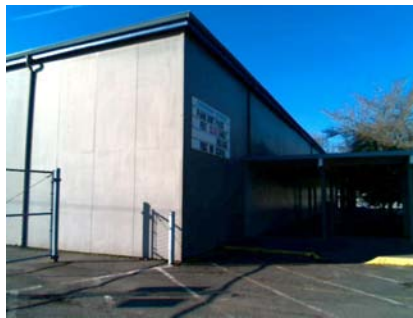
NE Pounding Potential