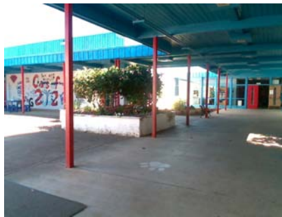
NW Plan Irregularity Primary