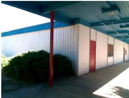
NW Primary Structural Type Also shows w2 secondary structural type on the left.