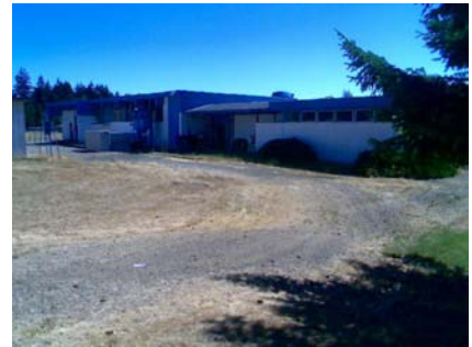
E Plan Irregularity Primary