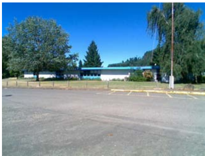
W General Site