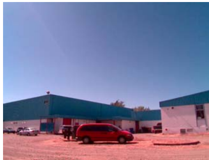
SE Vertical Irregularity Primary