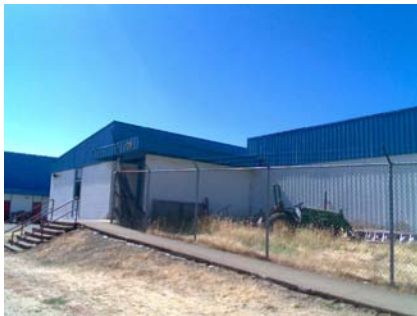
SE Vertical Irregularity Primary