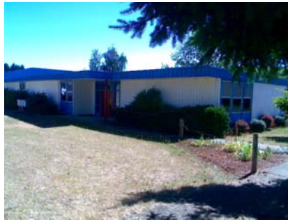
NE Plan Irregularity Secondary