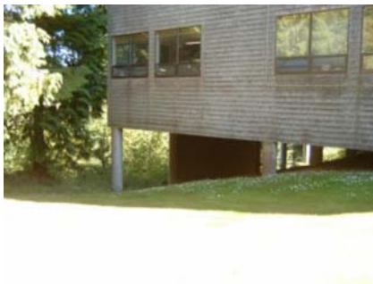
N Vertical Irregularity Primary