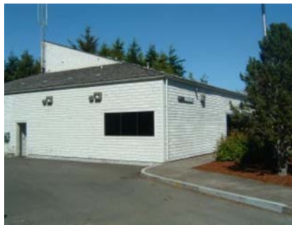
W General Site