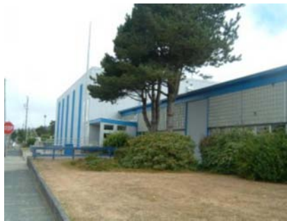
SW General Site