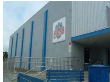
W Primary Structural Type