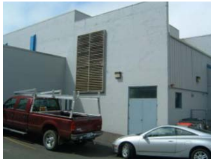
NE Primary Structural Type secondary and tertiary structural types also