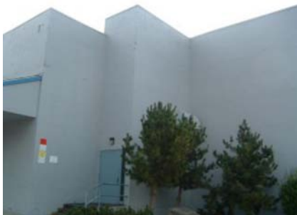
NW Plan Irregularity Primary step in elevation also