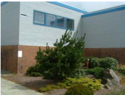
S Plan Irregularity Primary