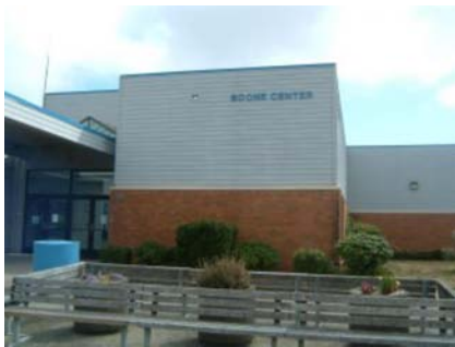
W General Site Boone Center - 1994 Addition