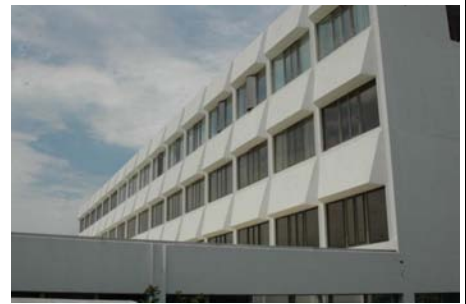
E Vertical Irregularity Primary