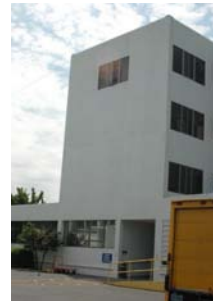
E General Site