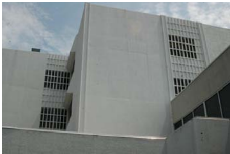
S Secondary Structural Type