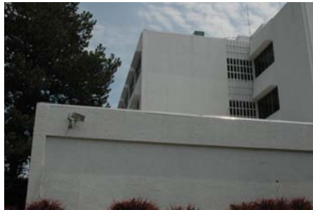
E Secondary Structural Type