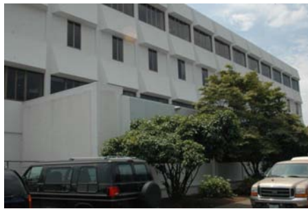
N Primary Structural Type Also Cladding (solid concrete awnings) .I beam -shaped pieces. Plan irregularity