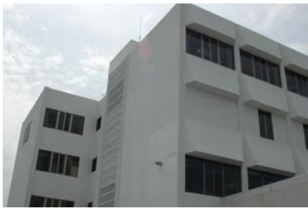
NE General Site