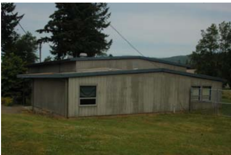
E Vertical Irregularity Primary