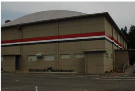
SE General Site