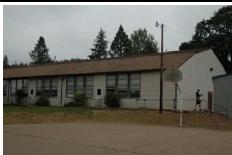
SW General Site