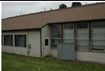
E Plan Irregularity Primary