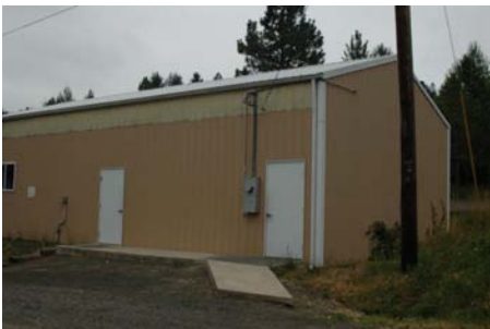
SW Primary Structural Type