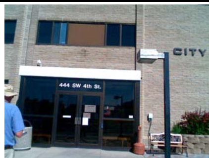
W Elevation View