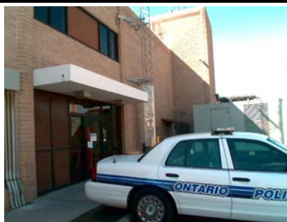
E Elevation View