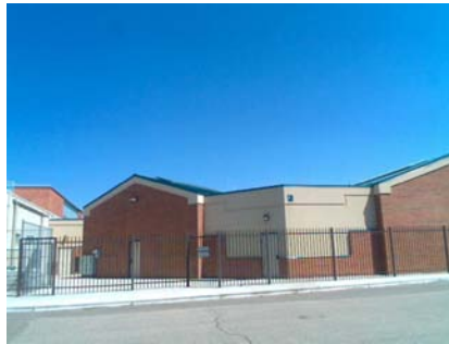
S Elevation View