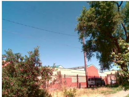
E Elevation View