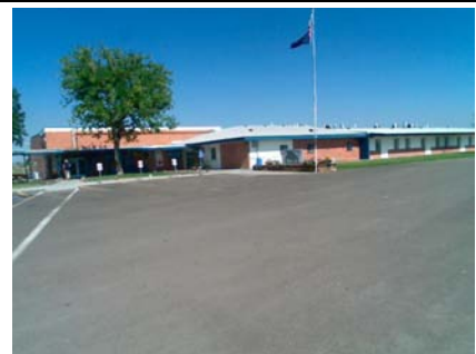
E Elevation View