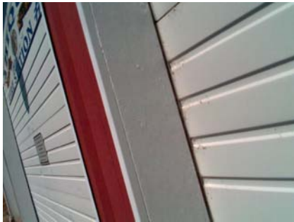
SE Primary Structural Type