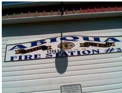
SW Building Name