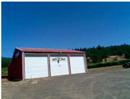
W Elevation View