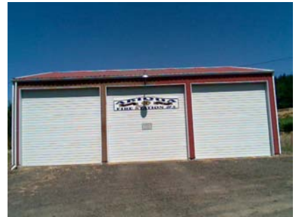
SW Plan Irregularity Primary