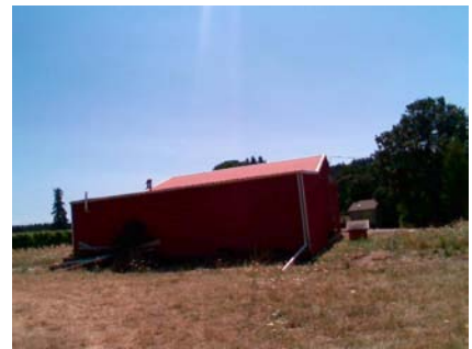
NW Elevation View