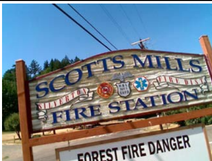
N Building Name