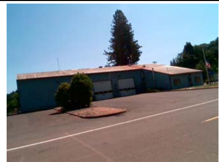
W Plan Irregularity Primary