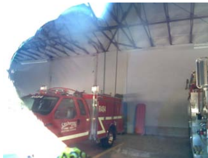
W Primary Structural Type