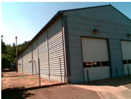
N Elevation View