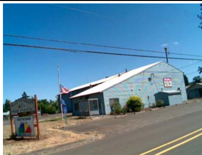
S Elevation View