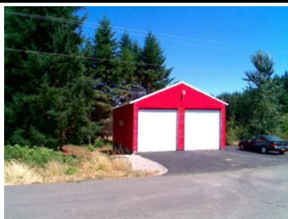
SW Elevation View