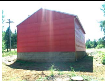
NW Elevation View