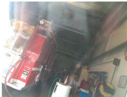
N Primary Structural Type