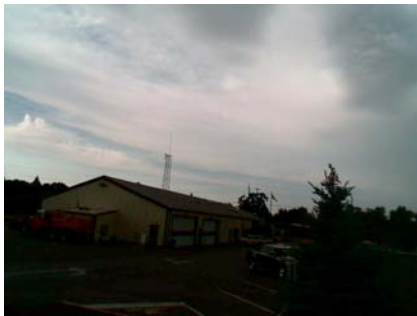
SE Elevation View