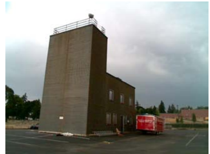
SW General Site PRACTICE TOWER