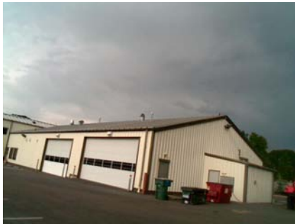
SW Elevation View