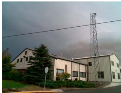
NW Plan Irregularity Primary