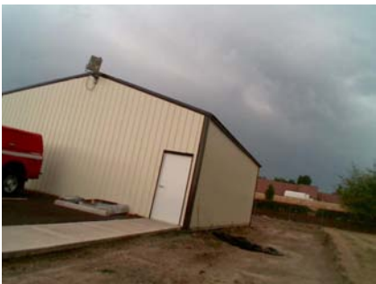
SW Elevation View