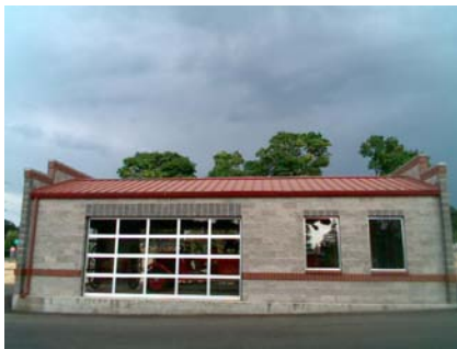
N General Site MUSEUM NOT SCREENED