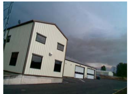
NW Plan Irregularity Primary