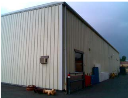
SW Elevation View