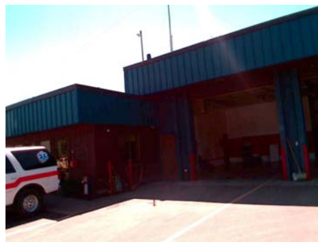
NE Vertical Irregularity Primary