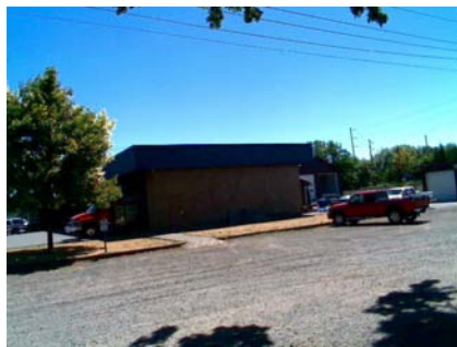
NW General Site