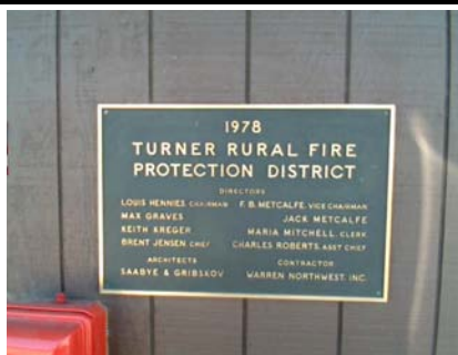
NE Field Verified Year Built 1978