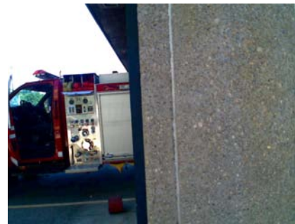
NW Primary Structural Type