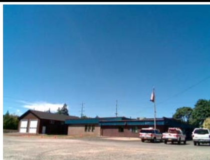
SE General Site