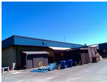
NW General Site