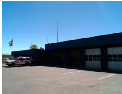
N General Site