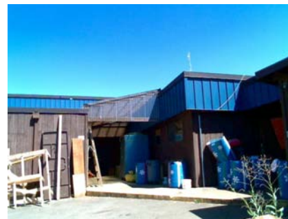
W Plan Irregularity Primary