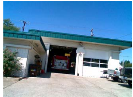
E Plan Irregularity Secondary