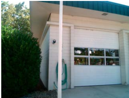
NW Elevation View