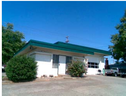
SE Vertical Irregularity Secondary