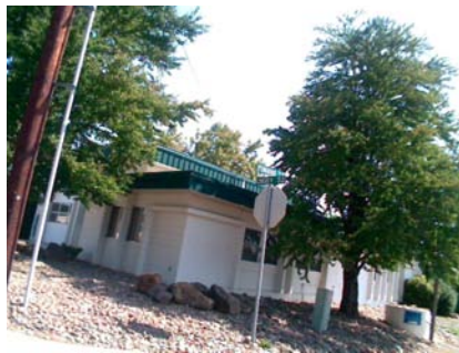
SW Vertical Irregularity Primary