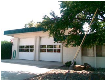
W Plan Irregularity Secondary