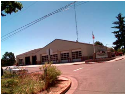
NW General Site