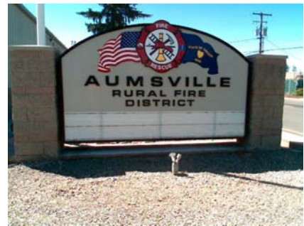
NW Building Name