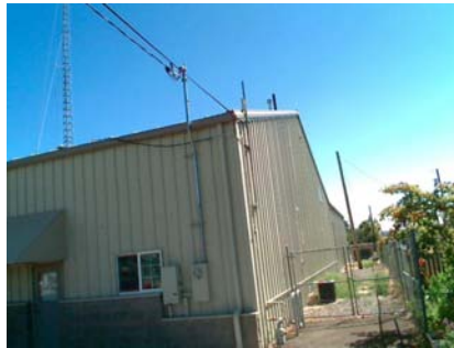
SW General Site