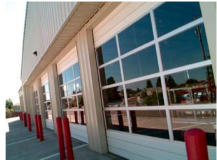
NW General Site