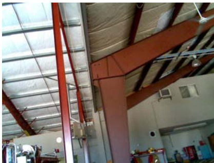
NW Primary Structural Type