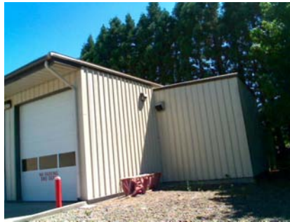
NW Plan Irregularity Primary