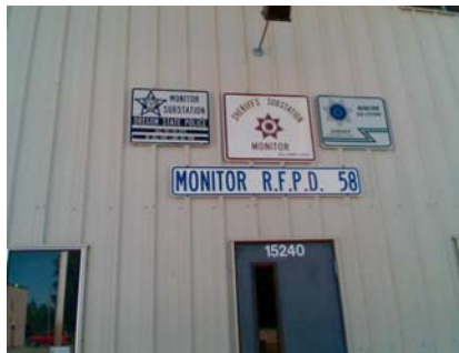
NW Building Name