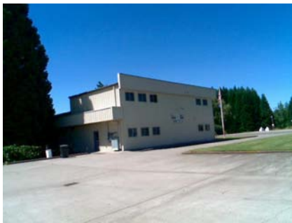
SE General Site