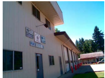
NE General Site