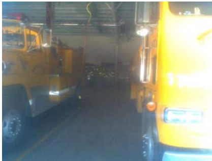
N Primary Structural Type S3