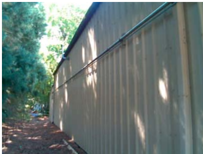
SE General Site