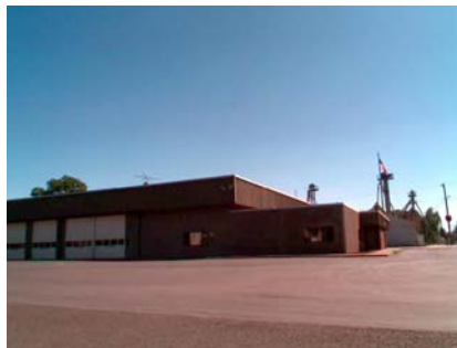
W Vertical Irregularity Primary