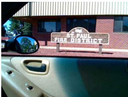
SW Building Name