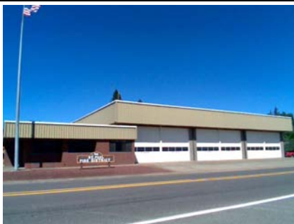
SW General Site