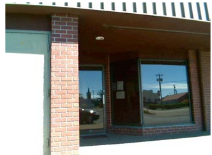
W Falling Hazard