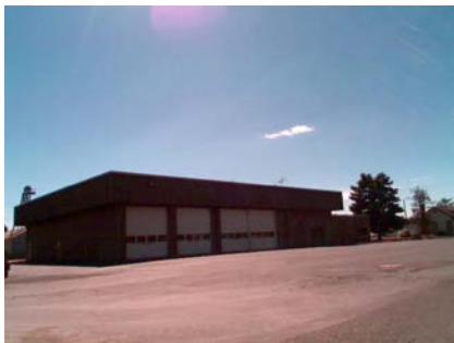
E General Site