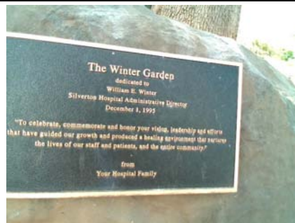
E Field Verified Year Built