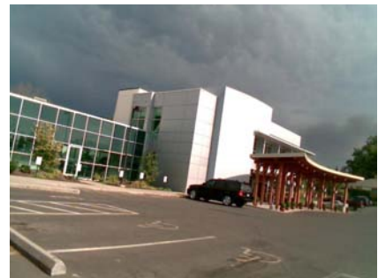
W Elevation View 2002 section