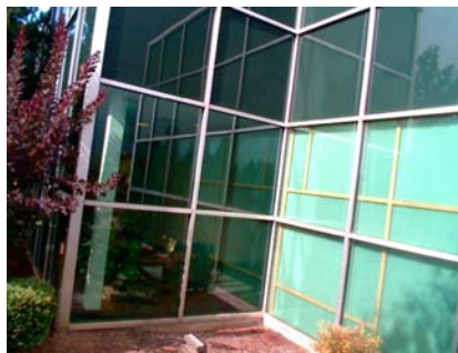
W Primary Structural Type