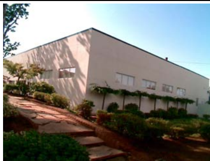
SE Elevation View EFIS WALLS ON NEWER PART