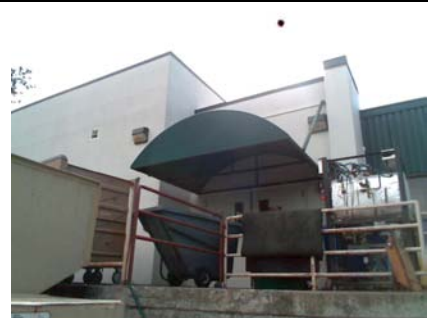
E General Site CONN TO OLD