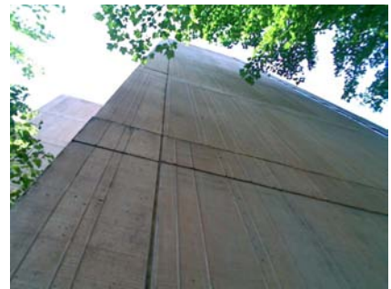
N Primary Structural Type CLADDING JTS