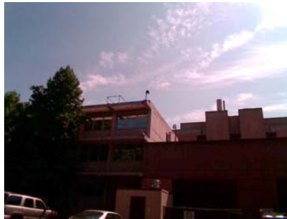
W Vertical Irregularity Secondary