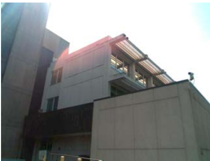
NW Primary Structural Type