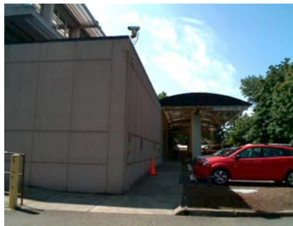
NW Falling Hazard 1990 ADDN