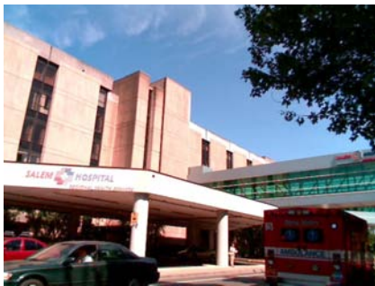
E Falling Hazard