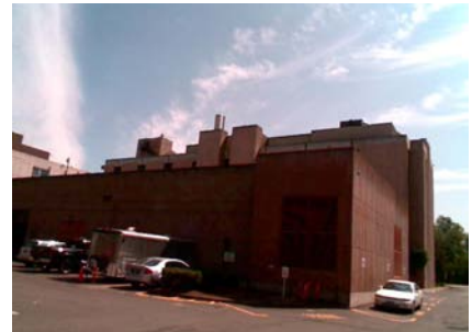
SW Vertical Irregularity Primary