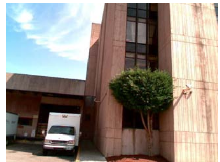
S Vertical Irregularity Primary