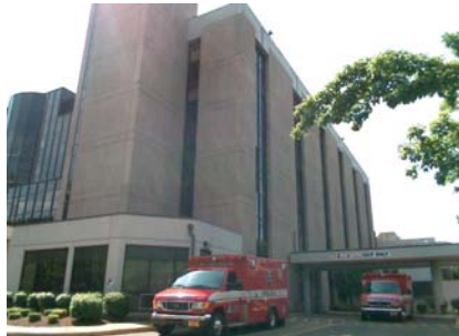
NW Elevation View