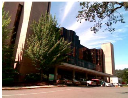
NE Vertical Irregularity Primary