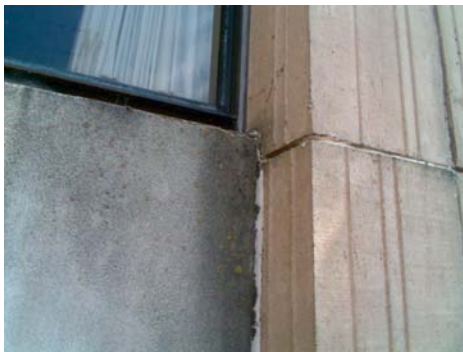
S Primary Structural Type