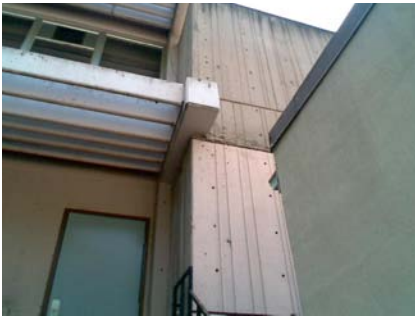
W Pounding Potential