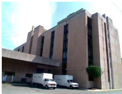
S Elevation View