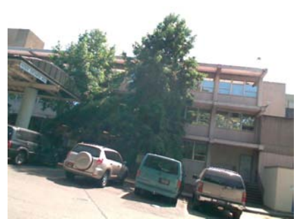
W Vertical Irregularity Tertiary