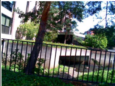
SE General Site FDN W STREAM