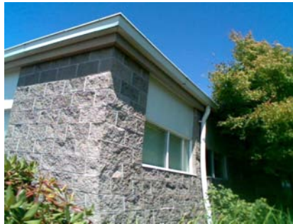
S Primary Structural Type