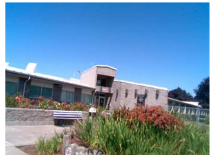
SE Plan Irregularity Primary