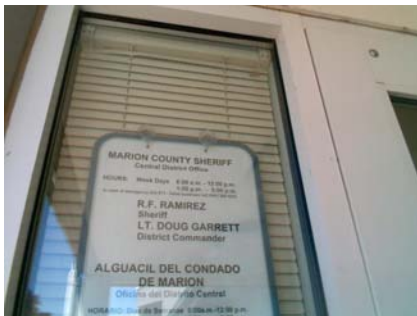
SE Building Name