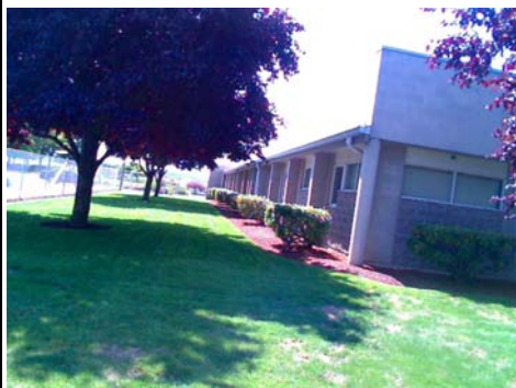
E Falling Hazard