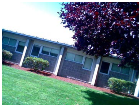
SE Vertical Irregularity Primary