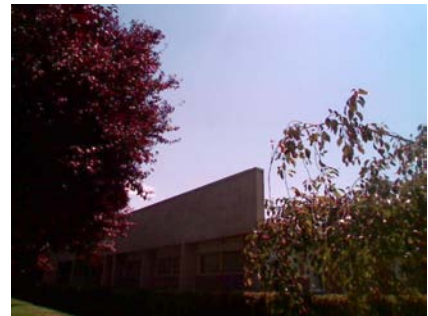
N Falling Hazard