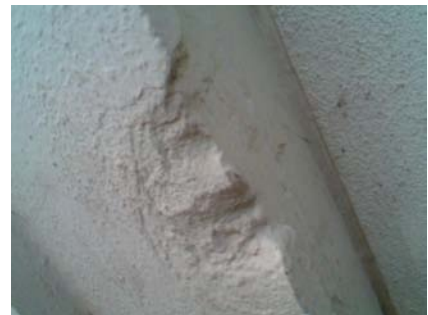
NW C2 Primary Structural Type