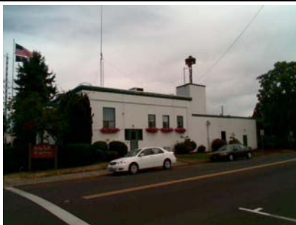
SW General Site