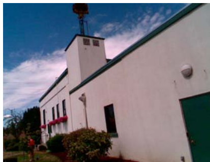
E Vertical Irregularity Primary