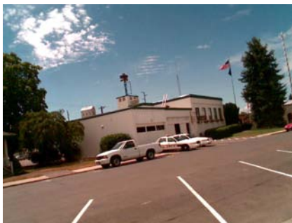
NE General Site