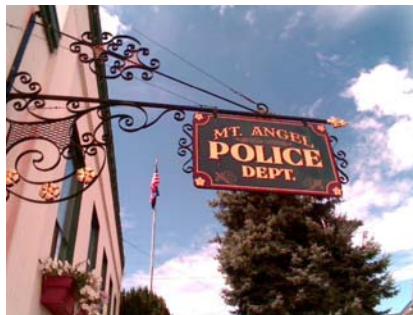
E Building Name