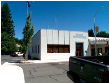
NW General Site