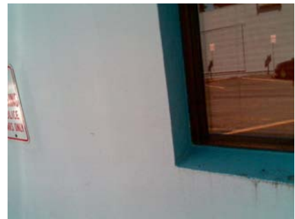
NW Primary Structural Type