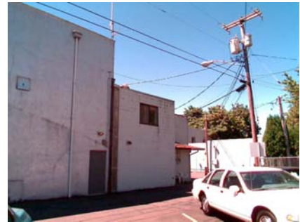
E General Site