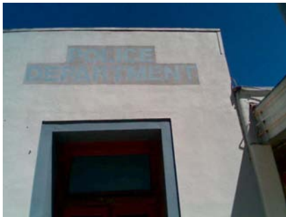
W Building Name