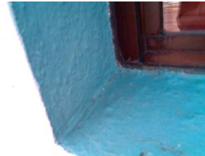
NW Primary Structural Type