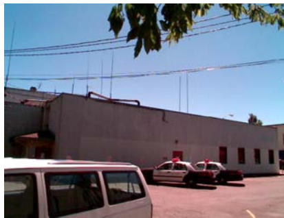
NE General Site