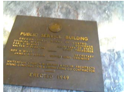
W Field Verified Year Built