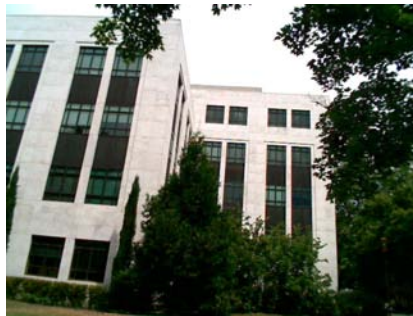
S Elevation View