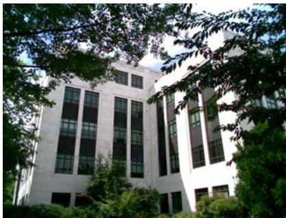
NE Vertical Irregularity Primary