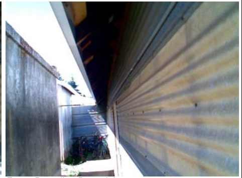
E Pounding Potential