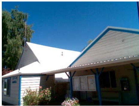
SW General Site