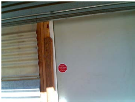
S Building Quality Structural members