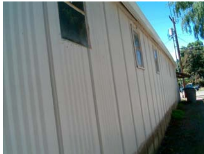
NE General Site