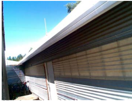
SE General Site