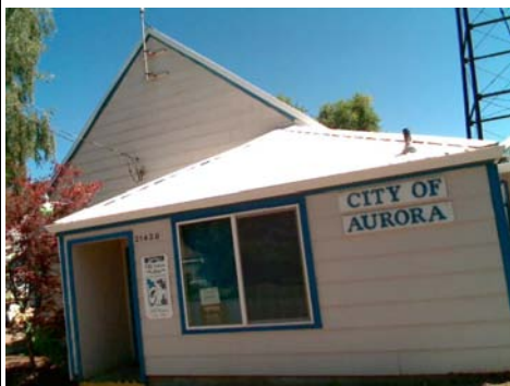
SW Vertical Irregularity Primary