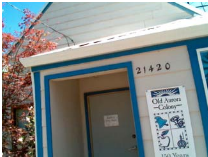
SW Building Name