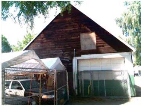
E General Site