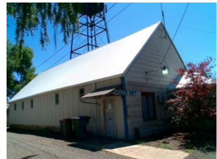
NW General Site