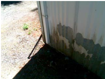
NW Poor Condition no foundation, timber on dirt.