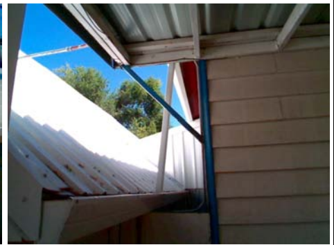
W Pounding Potential