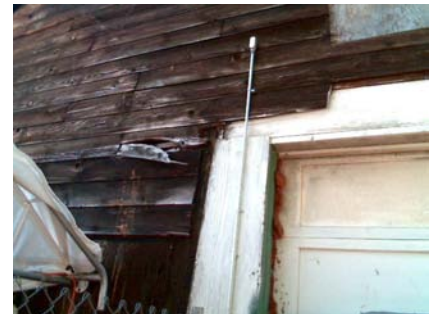
E Poor Condition