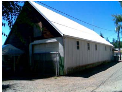
NE General Site