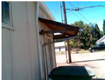
NE Falling Hazard