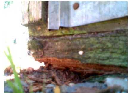
NW Poor Condition dry rot. NO Foundation,