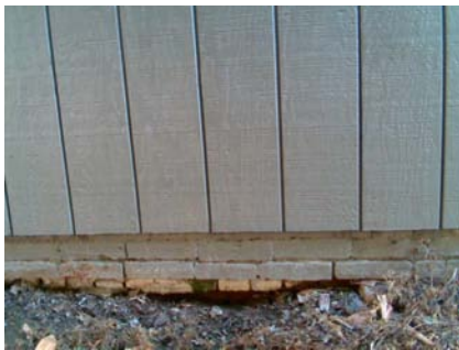
N Building Quality