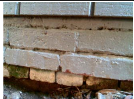
NE Building Quality brick foundation, police officer said it goes down about 6 inches.