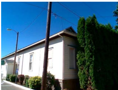
SE General Site