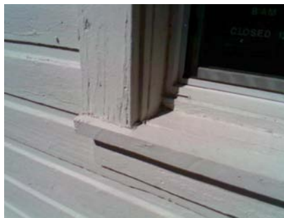
S Primary Structural Type