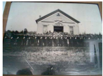
NW General Site 1900 photo of building