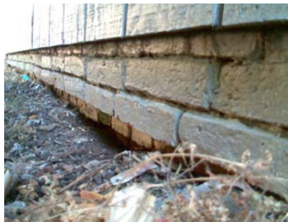
NW Building Quality whole wall is sliding off foundation