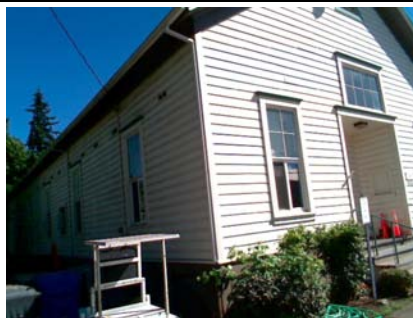
NW General Site