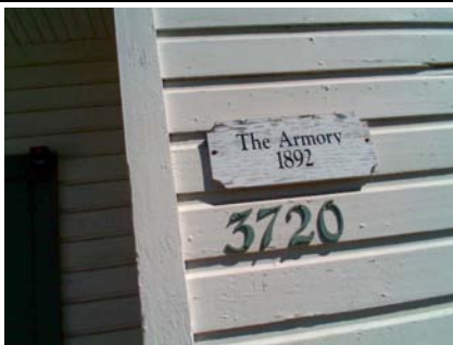
W Field Verified Year Built 1892