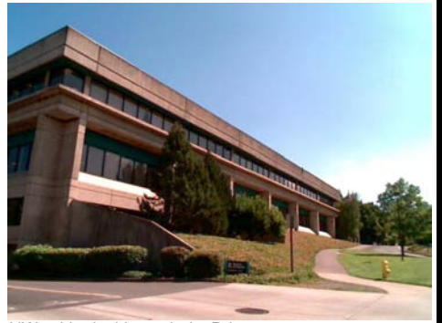
NW Vertical Irregularity Primary