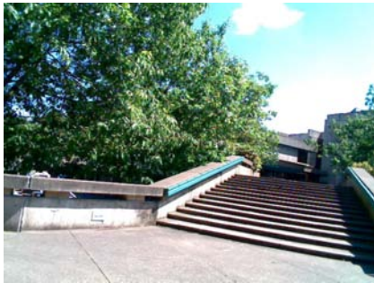
NW Elevation View