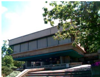
N Falling Hazard