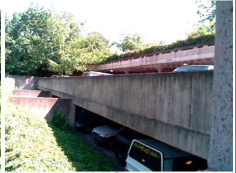
NW Vertical Irregularity Primary