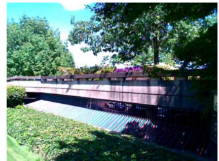
W Elevation View