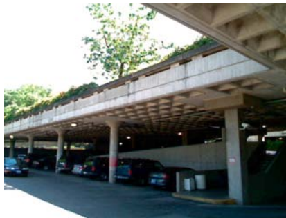
NW Secondary Structural Type