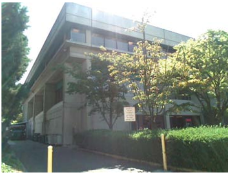
NE Vertical Irregularity Primary