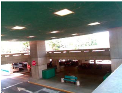
S Primary Structural Type SEE POLICE CAR TO LEFT