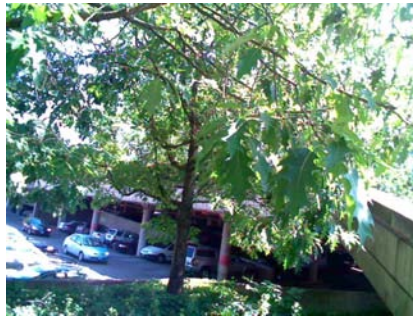
NW Secondary Structural Type