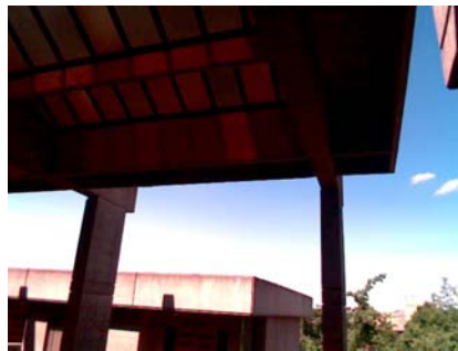
N Falling Hazard