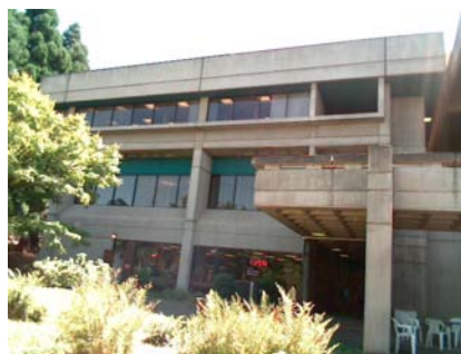
N Elevation View