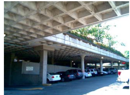
NE Secondary Structural Type