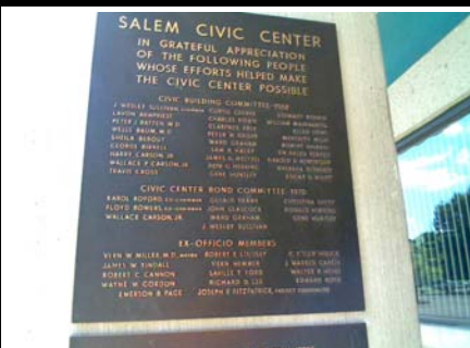
S Field Verified Year Built