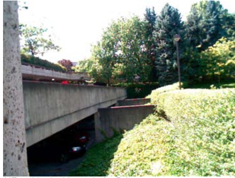
NE Vertical Irregularity Primary