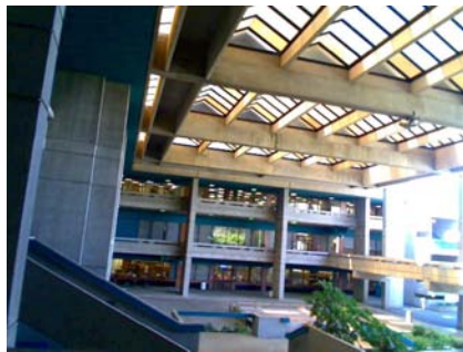
E Vertical Irregularity Primary