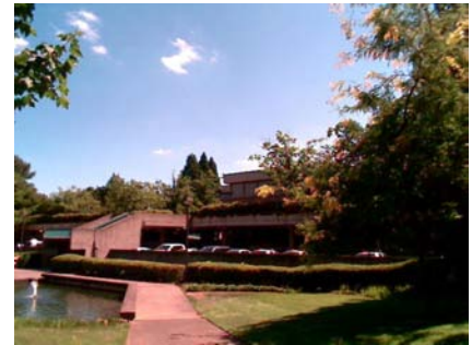
NW Vertical Irregularity Primary