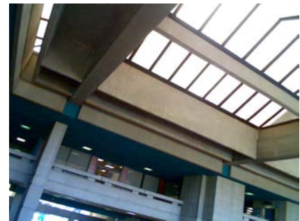
N Falling Hazard