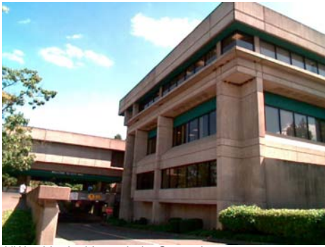
NW Vertical Irregularity Secondary