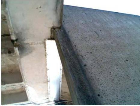
N Building Design Level