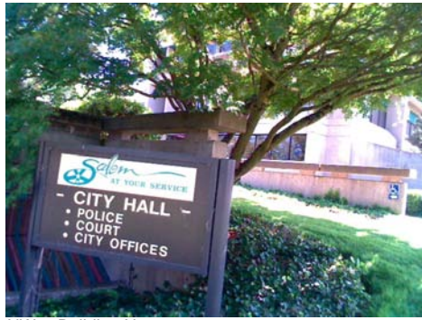
NW Building Name