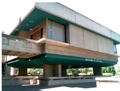
N General Site