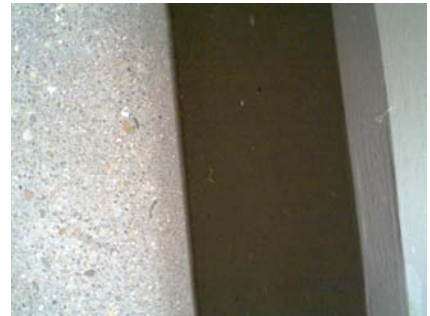
S Primary Structural Type