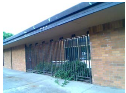
NE Pounding Potential