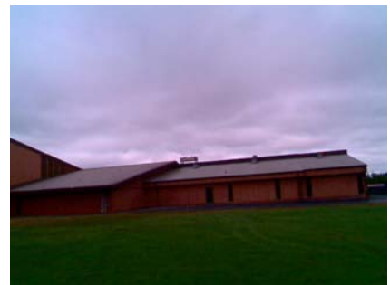
NE General Site