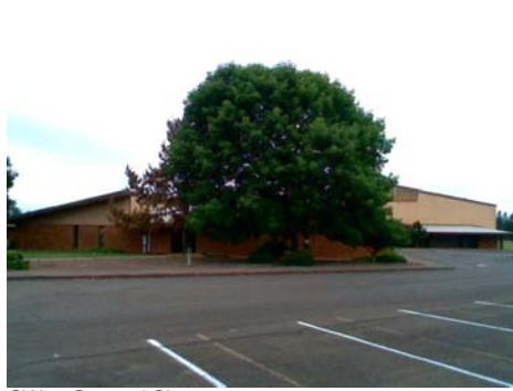
SW General Site