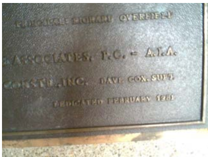
S Field Verified Year Built 1981