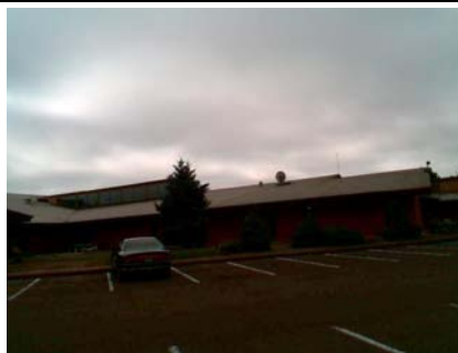
NE General Site