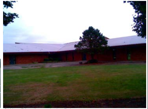
SW Plan Irregularity Primary