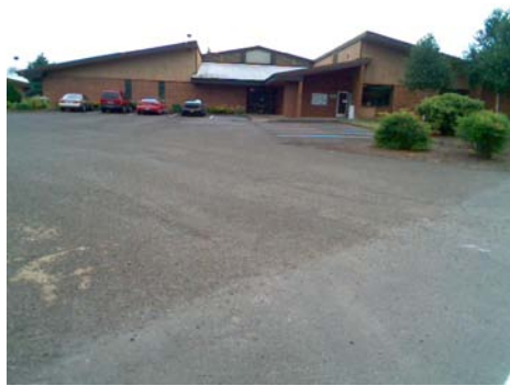
W General Site