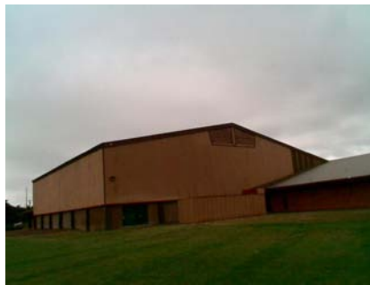
NE General Site