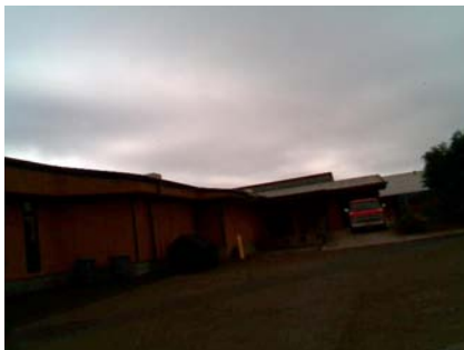
NW General Site