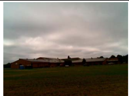
NW General Site