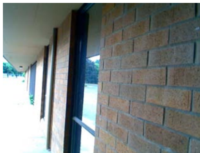
N Falling Hazard