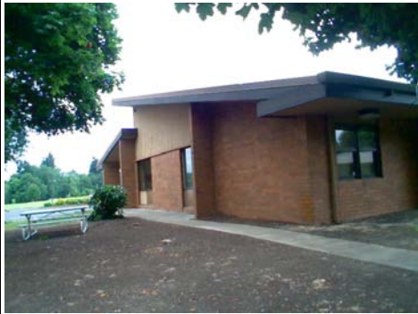
W General Site