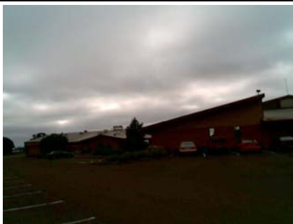
NW General Site