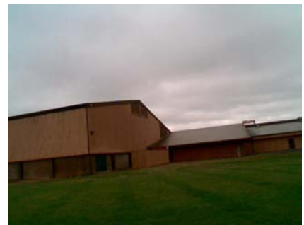
E Plan Irregularity Primary