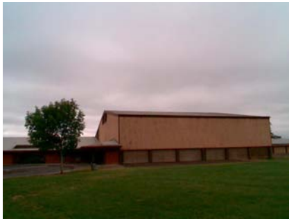
SE General Site