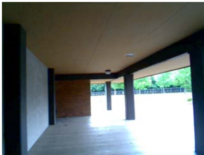
W Pounding Potential