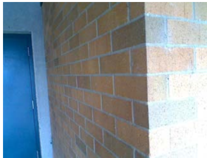
S Falling Hazard