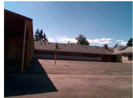
E Plan Irregularity Primary