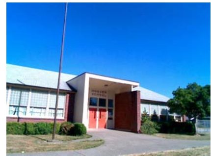
W Building Name