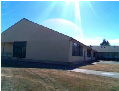
SE Elevation View