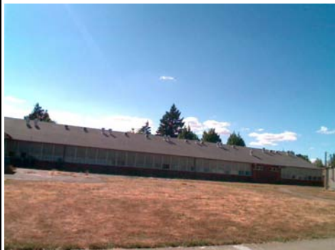
E Elevation View