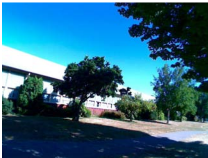
W Elevation View