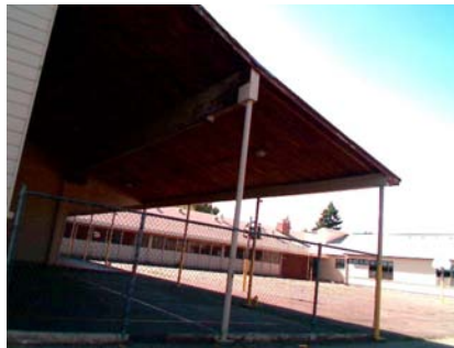
E Falling Hazard