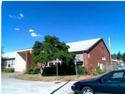
SW Elevation View