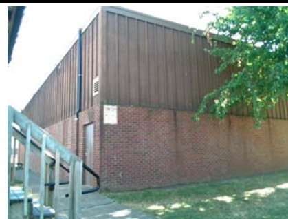
NE Elevation View