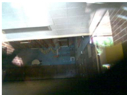
W Primary Structural Type STL ROOF TRUSSES AND SHEETROCKED WALLS