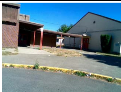
W Falling Hazard