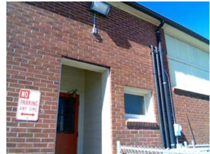
S Primary Structural Type