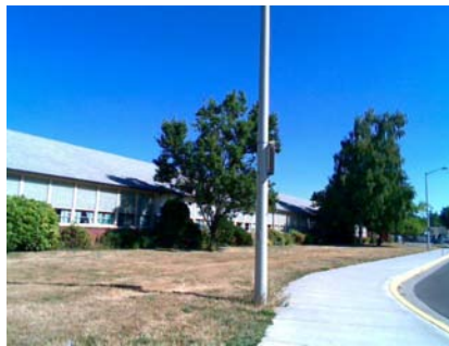
W Elevation View