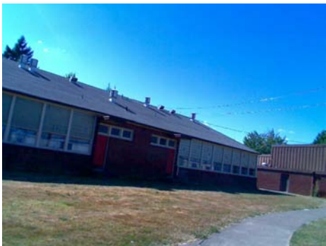
E Elevation View