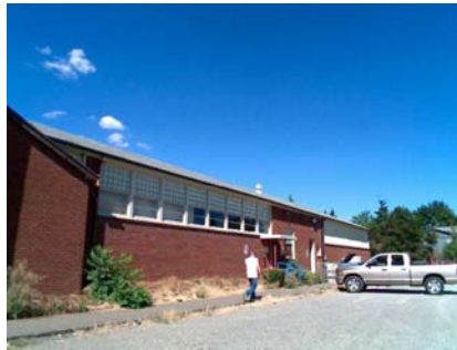
S Elevation View