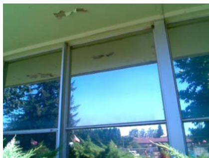
SW Building Quality