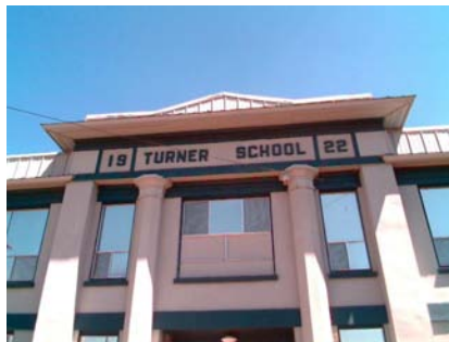
W Field Verified Year Built