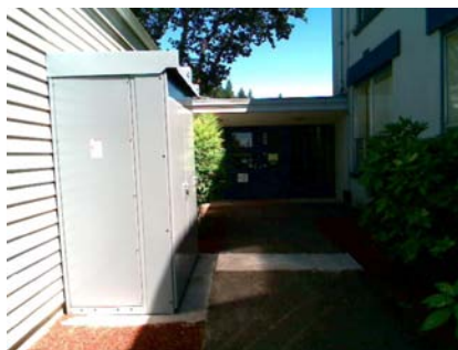
SW Pounding Potential