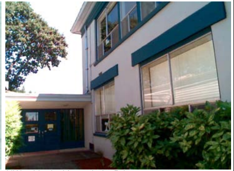
NW Vertical Irregularity Primary