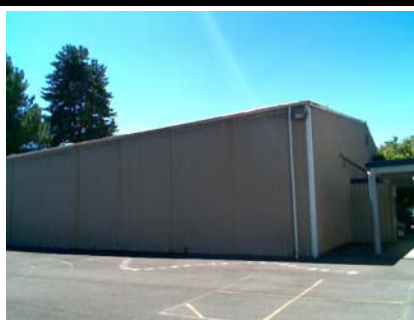
N General Site