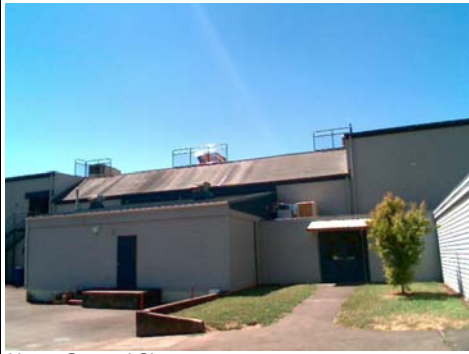
N General Site