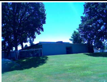
NW General Site