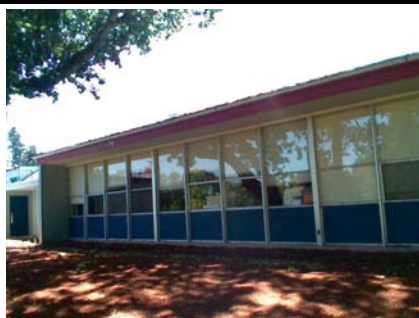
N General Site