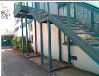
W Falling Hazard