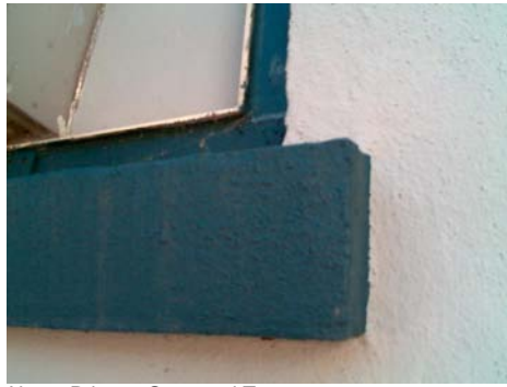
N Primary Structural Type