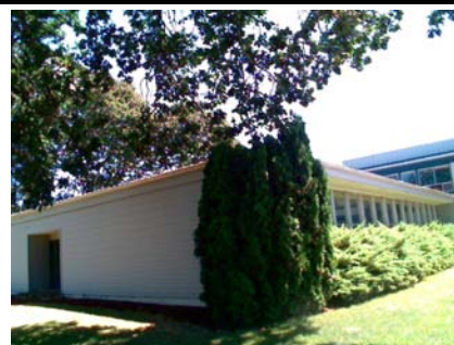
NW General Site