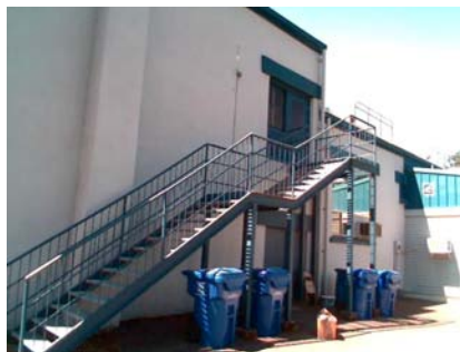
SE Falling Hazard