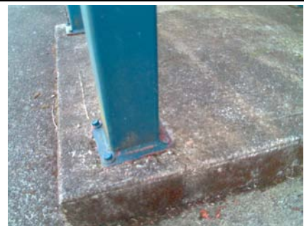
NW Falling Hazard