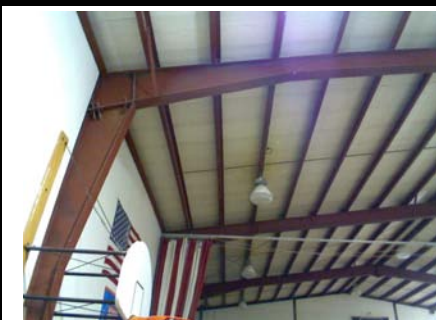
W Primary Structural Type