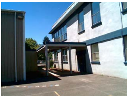
E Falling Hazard