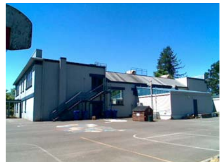
E General Site