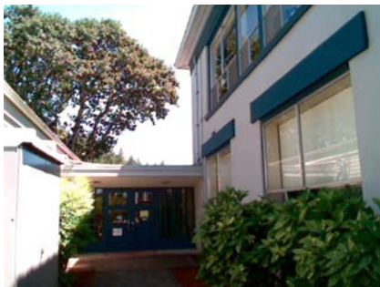
NW Pounding Potential