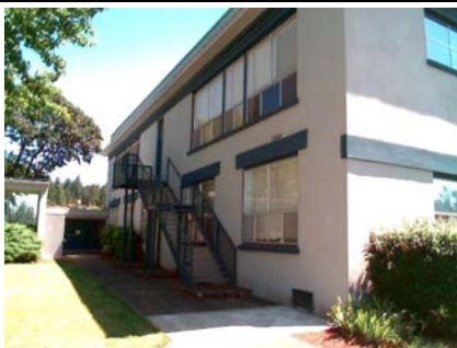
W General Site