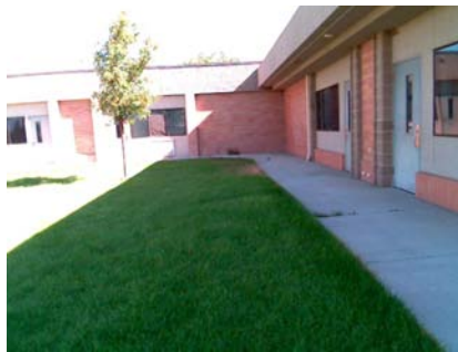
SW Plan Irregularity Secondary