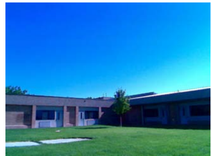
SW Vertical Irregularity Primary