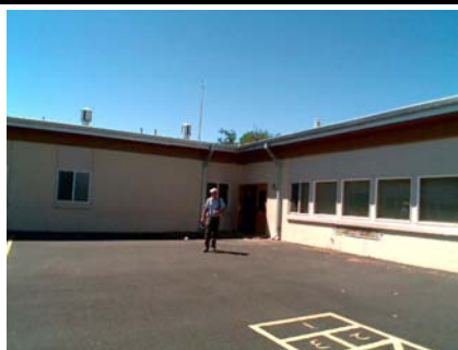
NE Plan Irregularity Primary