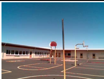
SE Plan Irregularity Primary