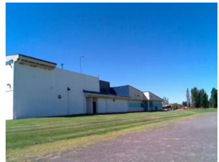
NE Vertical Irregularity Secondary