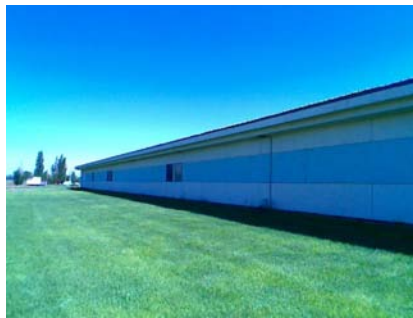
SW Elevation View