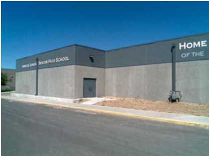
SE Plan Irregularity Primary