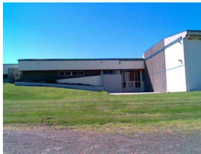
N Vertical Irregularity Secondary