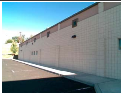
N Vertical Irregularity Secondary