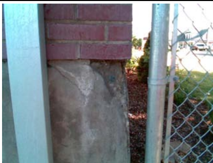
N Poor Condition