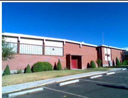
W Elevation View