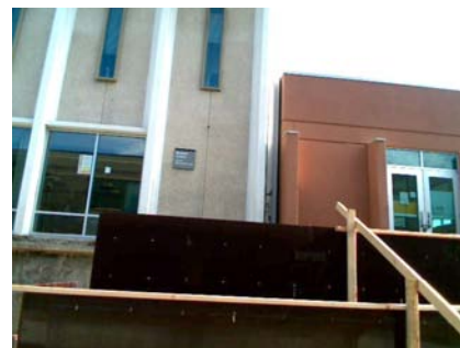
N Seismic Upgrade SEISMIC JOINT BETWEEN D AND F