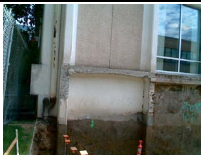
N Secondary Structural Type