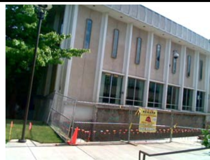
NE Elevation View