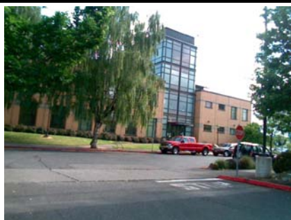
NE Vertical Irregularity Primary