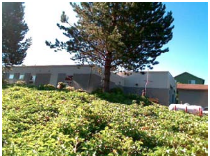
NW Plan Irregularity Primary