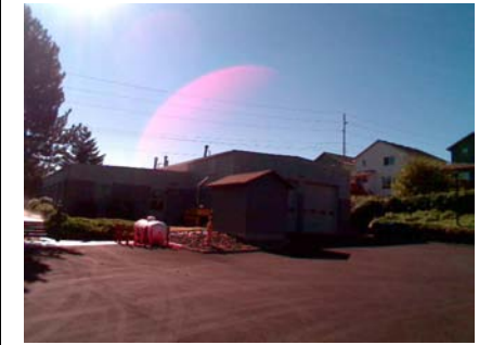
W Elevation View