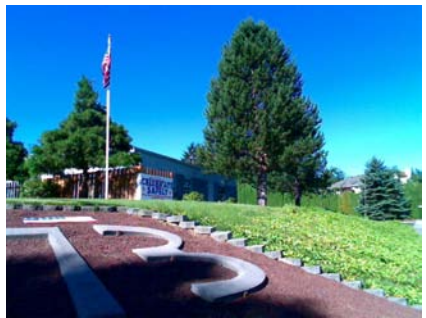
NE Elevation View