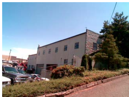
NW Vertical Irregularity Primary