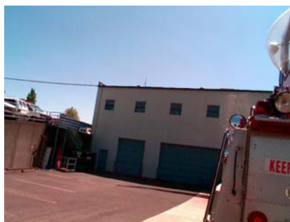
N Number of Stories