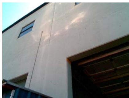
N Primary Structural Type