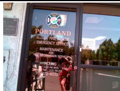
W Building Name