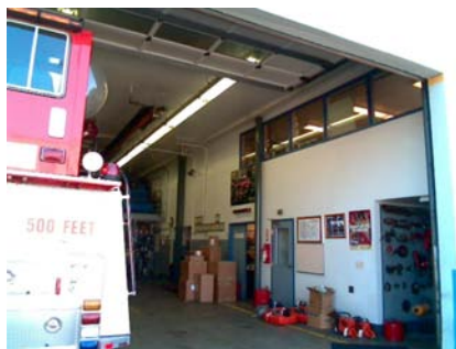
N Secondary Structural Type