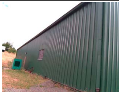
N Elevation View