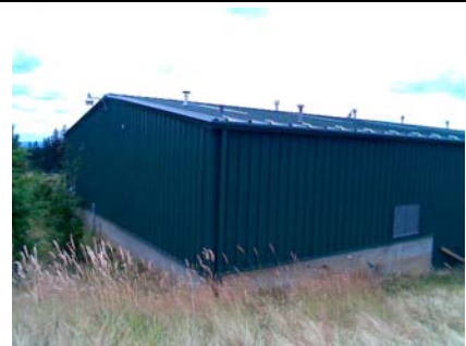
NE Elevation View