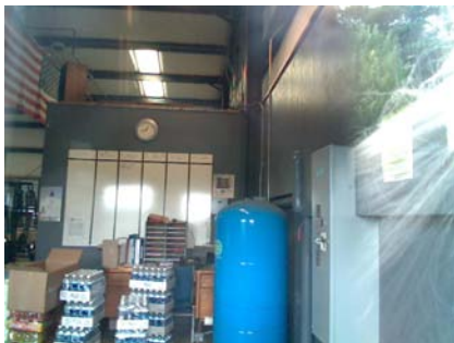
E Secondary Structural Type