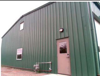
W Elevation View