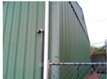
N Elevation View