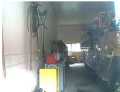
SW Primary Structural Type