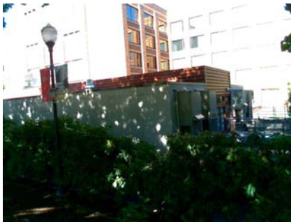
W General Site