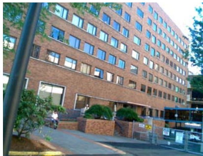
E Falling Hazard