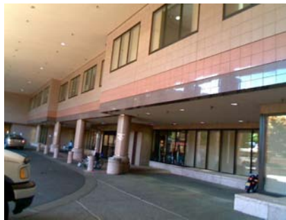
S Falling Hazard