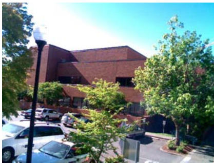
SE Vertical Irregularity Primary