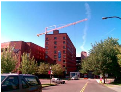
SE Elevation View