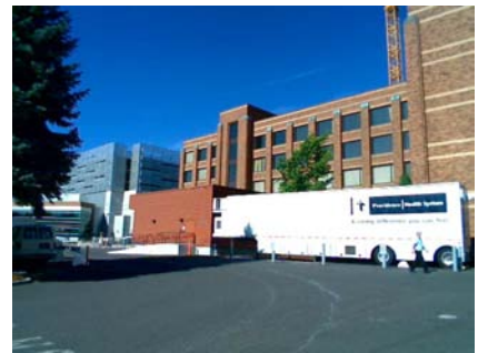
SW General Site