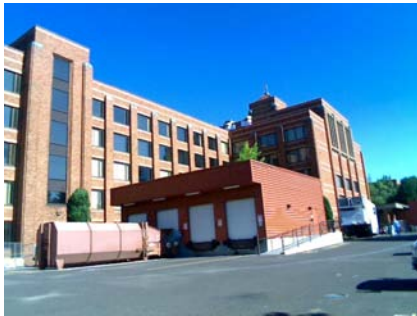
NW Plan Irregularity Primary