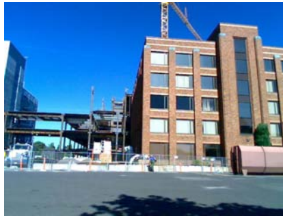
NW Plan Irregularity Secondary