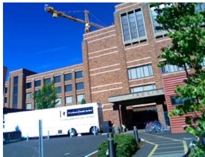
W Falling Hazard