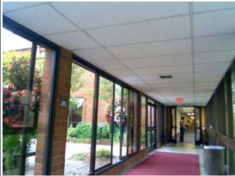
N Tertiary Structural Type