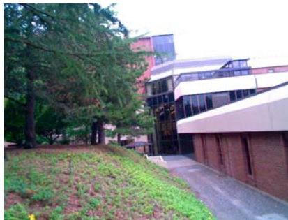
S Vertical Irregularity Primary