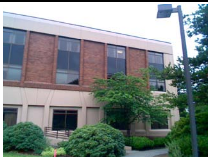
NE Primary Structural Type