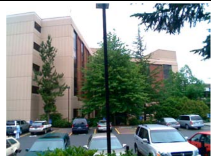
S Elevation View