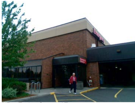
NE Tertiary Structural Type