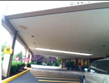
SW Primary Structural Type