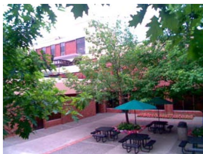
SE Plan Irregularity Primary