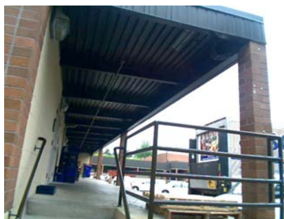
S Falling Hazard can also see cmu at dock