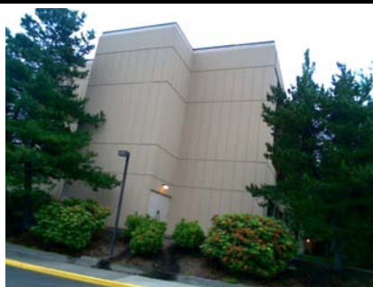
W Primary Structural Type