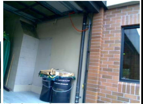
NE Secondary Structural Type