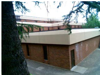
SW Vertical Irregularity Primary