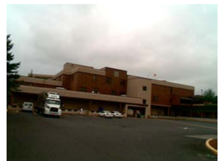
E Vertical Irregularity Primary