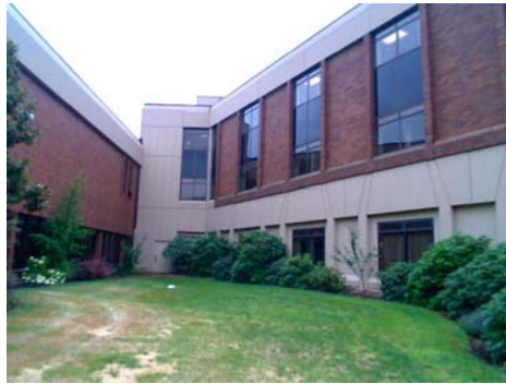
N Vertical Irregularity Secondary