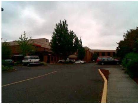
NE Plan Irregularity Primary