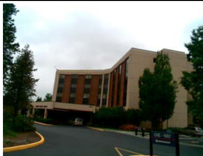
SW Number of Stories