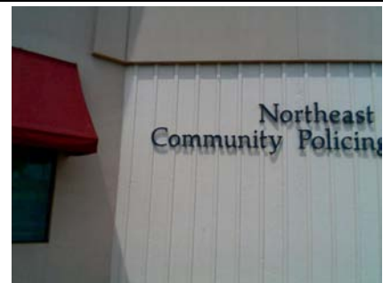
E Falling Hazard