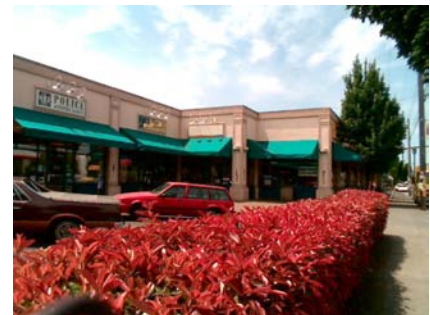
NE Plan Irregularity Secondary