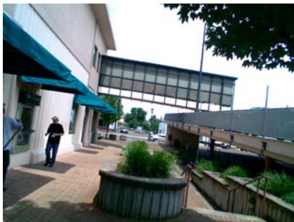
S Falling Hazard