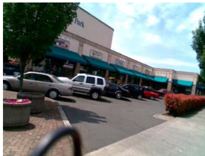
NE Plan Irregularity Secondary