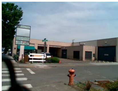
SW Plan Irregularity Primary