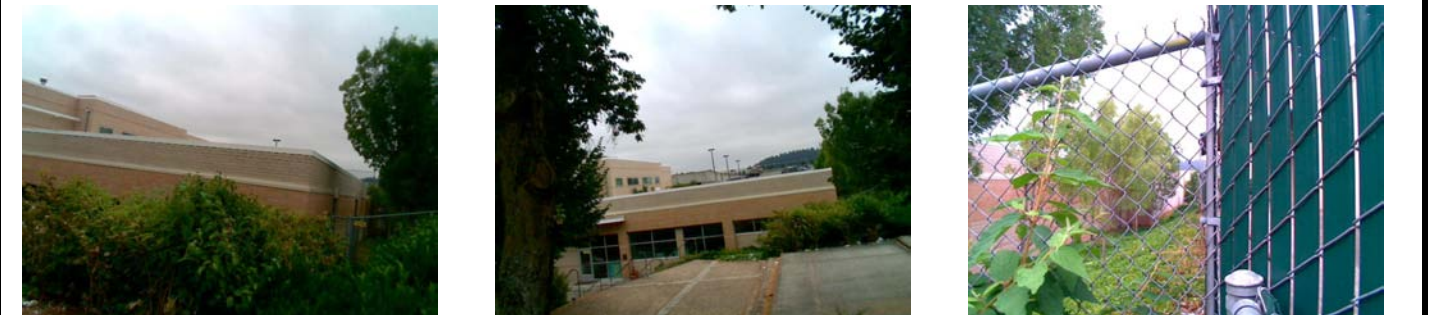
NW Vertical Irregularity Secondary